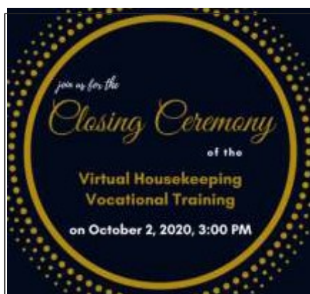
VOCATIONAL SERVICE COMMITTEE INITIATIVE (02/10)