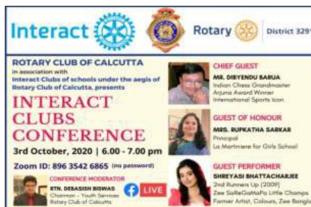
YOUTH SERVICE COMMITTEE INITIATIVE (3/10)